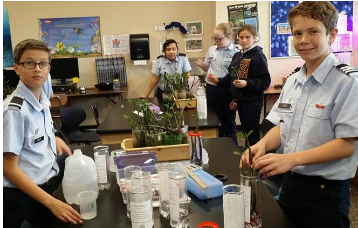
Cadets prepare mangroves for a Sarasota County free give-a-way

Each August, cadets collect stranded Red Mangrove propagules (seeds) from local beaches and waterways. (As long as the "props" are not rooted in the sand or rocks, they are able to be removed). Annually, cadets collect between 3000-5000 propagules for cultivation.